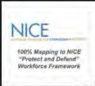
The National Initiative for Cybersecurity Education